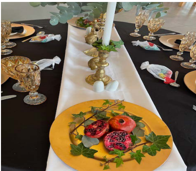
The table setting

We wish our Feedem kitchen all the best for the remainder of the competition.