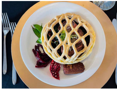
Deconstructed beef wellington