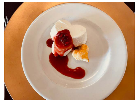
Vanilla infused cheesecake