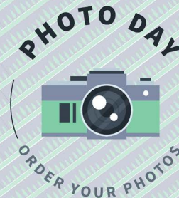
PHOTO DAY REMINDER

Culture Week at school was a vibrant celebration of talent and creativity. The highlight of the week was the inter-house singing contest, where Lakeside captivated everyone with their performance and claimed victory. The excitement continued with the inter-house art competition, where Orvis impressed with their creativity and emerged as the winners. Additionally, the first round of inter-house debating saw Loomis House triumph over Fenwick, setting the stage for a thrilling final debate to come.